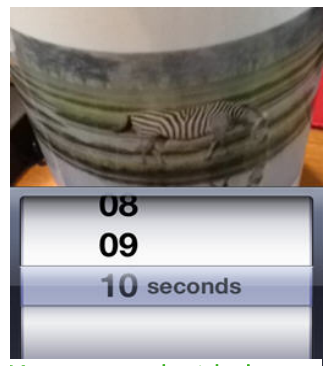
You get to decide how long your photo can be viewed.

Snapchat is a photo- and video-sharing app with a twist. The media you send disappear seconds after they're viewed—you get to decide how long a photo will "live," from 1 to